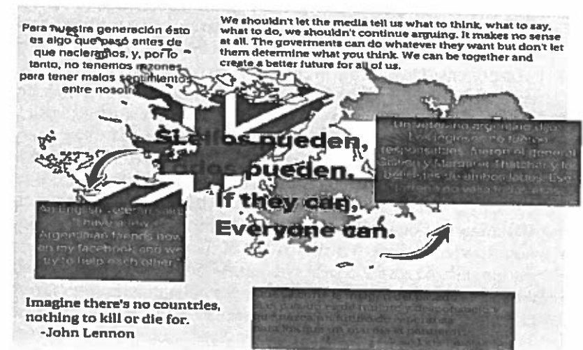
Figure 9.4 Collaborative advertisement for peace

This advertisement also challenges the 'common sense' of each national group, which together with the international identification is another characteristic of an intercultural citizenship project as outlined in the Introduction. This occurs in this case through the skills of comparing and contrasting, done visually by colouring the Malvinas/Falkland islands with the flags of both nations and by combining both languages, English and Spanish. It is also done by juxtaposing quotes from the two veterans of the war, as well as quotes by John Lennon (English) and José Luis Perales (Argentinean). This juxtaposition shows that, despite the confrontation represented by the location of both