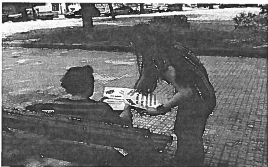
Figure 9.3 A student distributes a poster resulting from the project in Plaza Rocha, a centrally located square in La Plata

intercultural citizenship in foreign language education as described in the Introduction, namely: