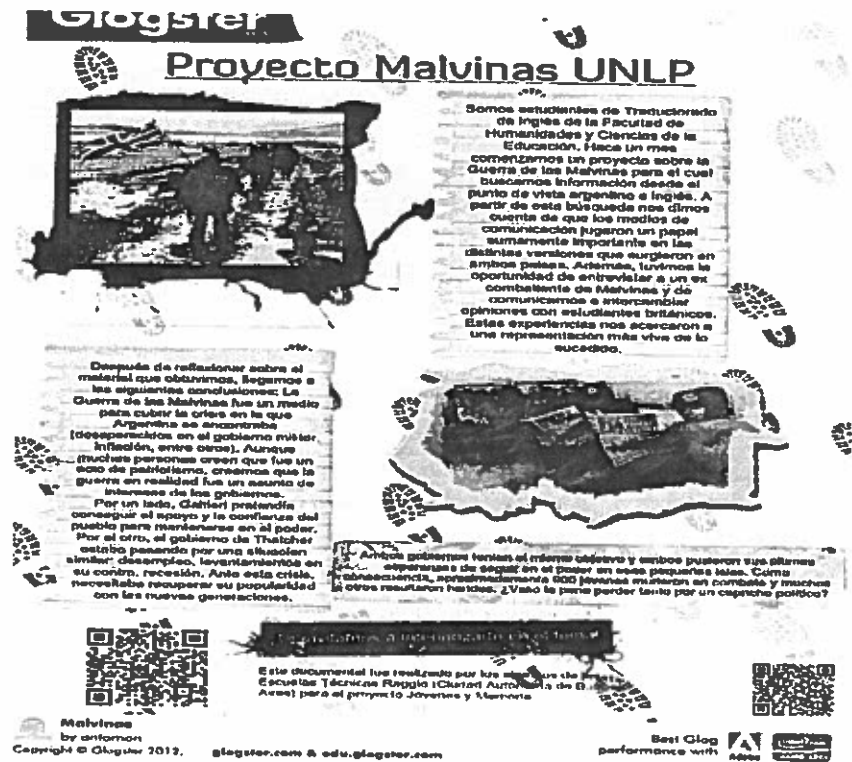
Figure 9.2 Awareness-raising leaflet about the war created with Glogster

transnational community, reflect together, propose and instigate change in their respective societies' (level 4).